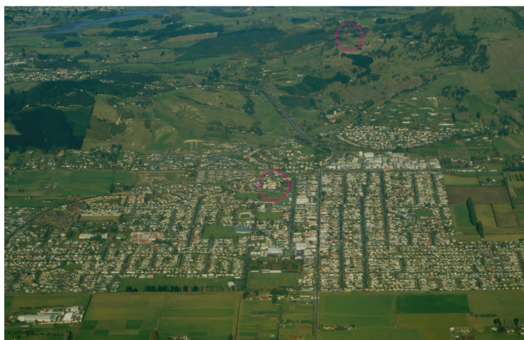
Above: Mosgiel from the air – repeater site on Saddle Hill and conference venue Burns Lodge are circled.

On Monday, following the conference, some attendees went to Larnach's Castle. Others visited two ham shacks on Saddle Hill above Mosgiel. Afterward we all gathered at the Clubrooms of Otago Radio Club. [ZL1TO]